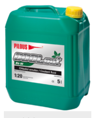
COOLcut Bio 90

In addition to use in saw bands the product is designed for machining operations carried out both on conventional machines and NC and CNC machining centres. Recommended concentration 4–7 %. 5 litres pack. Dilution 1:20.