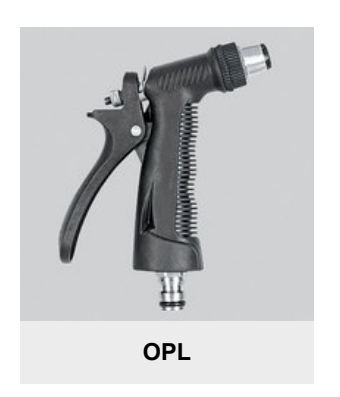
Rinse spray gun

Ensures accurate tensioning of the saw band to a required value according to the pressure gauge and its control during the use of the machine. Optimum tensioning of the saw band is essential for its service life and cutting accuracy.