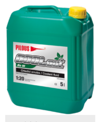
COOLcut Bio 90

In addition to use in saw bands the product is designed for machining operations carried out both on conventional machines and NC and CNC machining centres. Recommended concentration 4–7 %. 5 litres pack. Dilution 1:20.