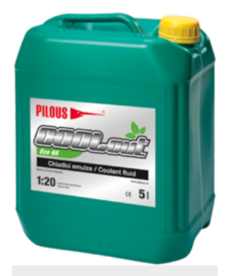
COOLcut Eco 65

In addition to use in saw bands the product is designed for machining operations carried out both on conventional machines and NC and CNC machining centres. Recommended concentration 4–7 %. 1 and 5 litres pack. Dilution 1:20.