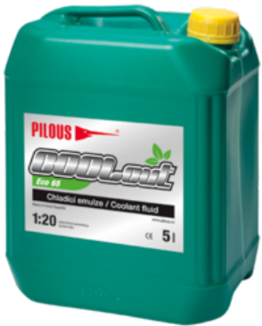
COOLcut Eco 65

In addition to use in saw bands the product is designed for machining operations carried out both on conventional machines and NC and CNC machining centres. Recommended concentration 4–7 %. 1 and 5 litres pack. Dilution 1:20.