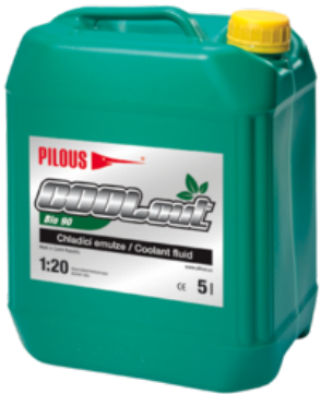
COOLcut Bio 90

In addition to use in saw bands the product is designed for machining operations carried out both on conventional machines and NC and CNC machining centres. Recommended concentration 4–7 %. 5 litres pack. Dilution 1:20.